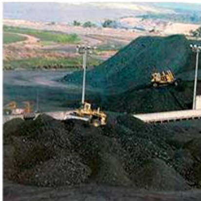
THERMAL COAL TYPE B

This Coal is within the ranges of the coque grades. Thermal Bituminous with a calorific value of 13,000 to 14,000 BTU.