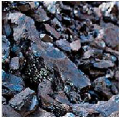
THERMAL COAL TYPE A

This Coal is within the ranges of the coque grades. Thermal Bituminous with a calorific value of 13,000 to 14,000 BTU.